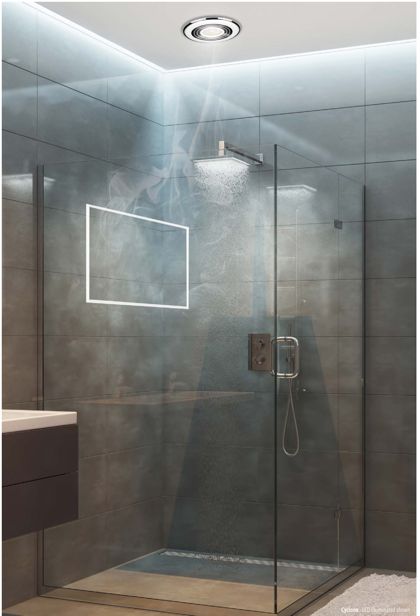
Cyclone - LED illuminated shown.