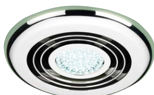
Cyclone - LED illuminated