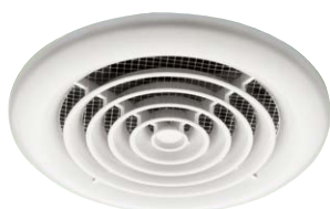
Cyclone - non-illuminated